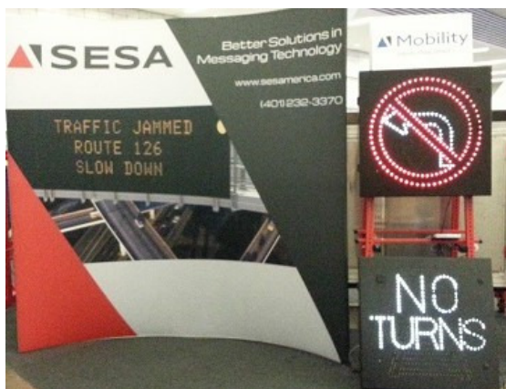
MUTCD compliant multiphase mobility

With summer in full swing , major construction projects are underway. Here is a quick list of types of ITS signs shipped in either the last 30 days or soon to leave the SESA America facility in the coming days.